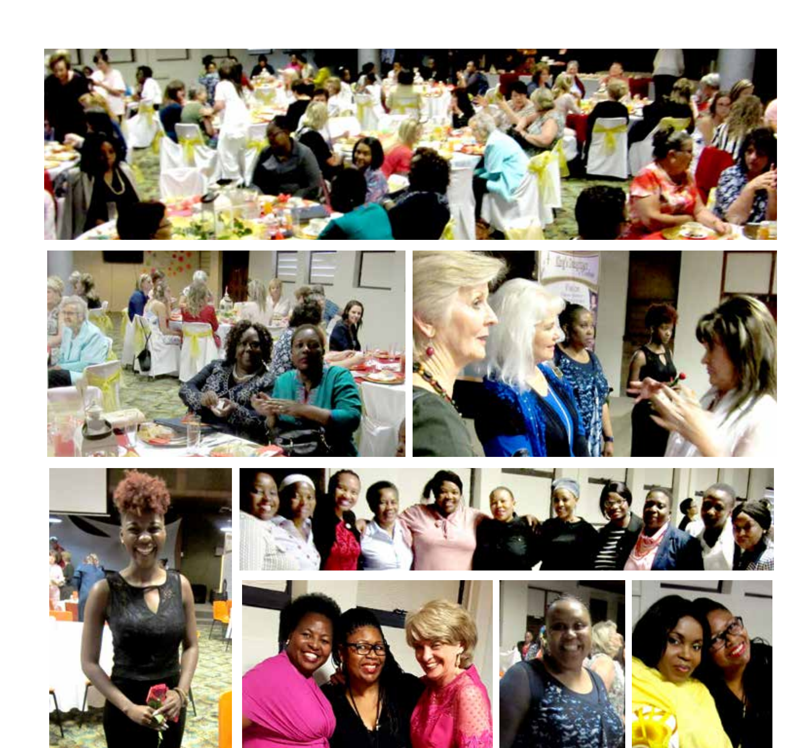
Our next King's Daughters Breakfast will be on 1 June 2019. Hope to see you there!