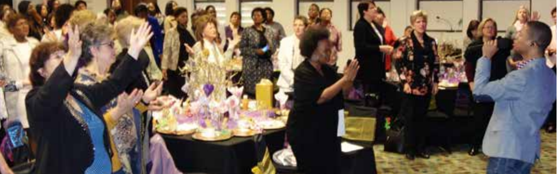
Tiro lead us in inspiring worship with great classic songs including 'How Great Thou Art!'